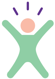
Waking too early in the morning