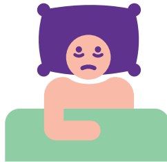
Difficulty remaining asleep