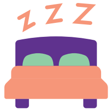
Trouble falling asleep