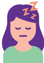
Feeling tired and irritable during the day

Insomnia symptoms occurring at least 3 times a week for at least 3 months is known as chronic insomnia .